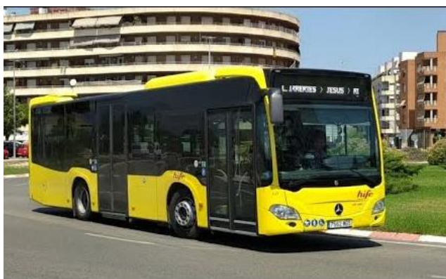
Hife Bus L1

Taxi's phone number: +34 618 55 21 49 (write them in Spanish or English by WhatsApp)